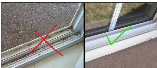
Before: Dirty Window Track